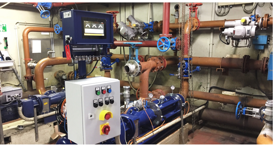
Installation of BN 35-6LAS including SEEPEX Pump Monitor at the plant.

SEEPEX Pump Monitor (SPM) is the digital connection that records operating data and parameters such as flow rate, pressure, rotor speed or temperature in real time. Together with the SEEPEX Cloud and SEEPEX Connected Services (SCS), it analyzes the above parameters using modern algorithms and artificial intelligence. The plant operator can easily monitor the operating status of the pump and remotely adjust the stator clamping. Any occurring wear that would significantly reduce the performance of the pump can be effortlessly compensated for by readjusting the stator clamping. This makes it possible to always set the pump to its optimal operating point, which is characterized by a defined flow rate per rotor revolution.