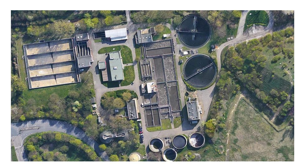
Gelsenkirchen Picksmühlenbach sewage treatment plant of the Lippeverband (LV)

The Gelsenkirchen Picksmühlenbach wastewater treatment plant of the Lippeverband (LV) is located in the north of the city of Gelsenkirchen and, as part of the municipal water management system, is responsible for treating wastewater for a local population of more than 57,000. The conveying and further processing of highly abrasive wastewater and sewage sludge are important process steps. For this task, the operator has successfully used a SEEPEX progressive cavity pump for many years.